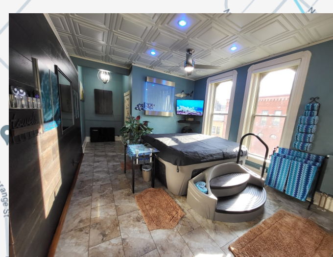
Skyline Vacation Rental