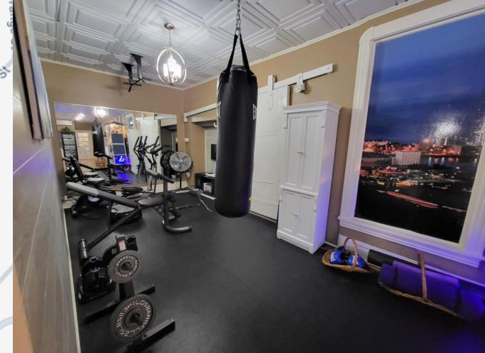
Academy of Fine Art